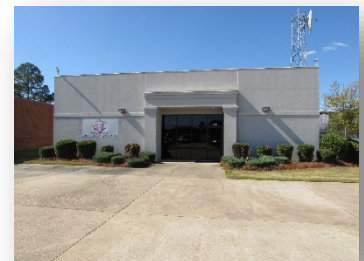
WMCF TV 45 Montgomery