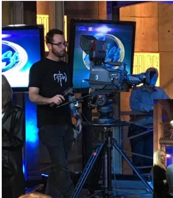
TBN Manager's Meeting Tustin, CA March 20 – 24, 2017