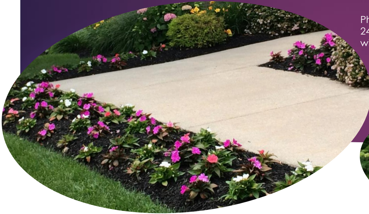
Photo on right: weeds, 24-hours after, sprayed with vinegar solution.

Our grounds are being prepared for the planting of colorful flowers. One of the most effective means to keeping our grounds weed free is the use of a green weed inhibitor. The recipe? Vinegar, salt, and dish soap.