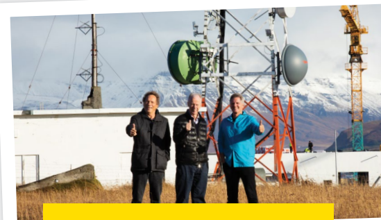
TBN Satellite in Iceland

"How many of those billions of people know Jesus, and how many don't?"