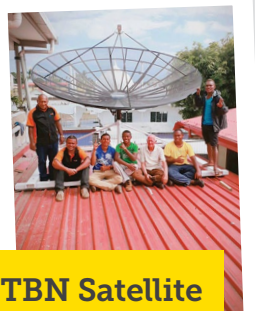
TBN Satellite in Fiji

Your prayers and support of TBN allow us to beam and stream life-changing Christian programming to over 175 nations on 30 networks in 17 languages. As a part of TBN's media missionary team, you make it possible to take the Gospel to every inhabited continent on earth 24 hours a day, 365 days a year. You make this happen! >>