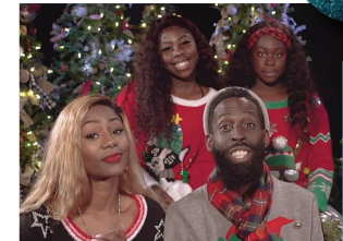
Christmas with Tye Tribbett and Friends