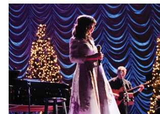
Sing! An Irish Christmas