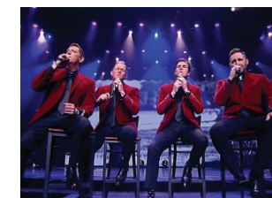
Christmas Joy with Ernie Haase & Signature Sound