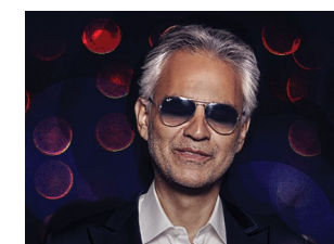
Andrea Bocelli: The Heart of Christmas

Be sure to check tbn.org/schedule often for an updated Christmas Specials list!