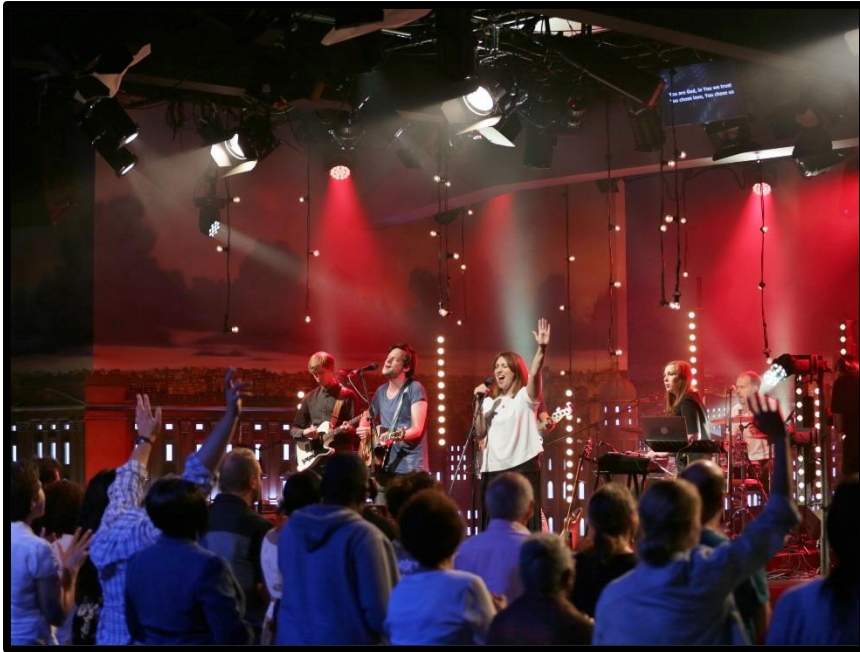
The KXC band, from King's Cross Church, were the musical guests for the September Praise program.