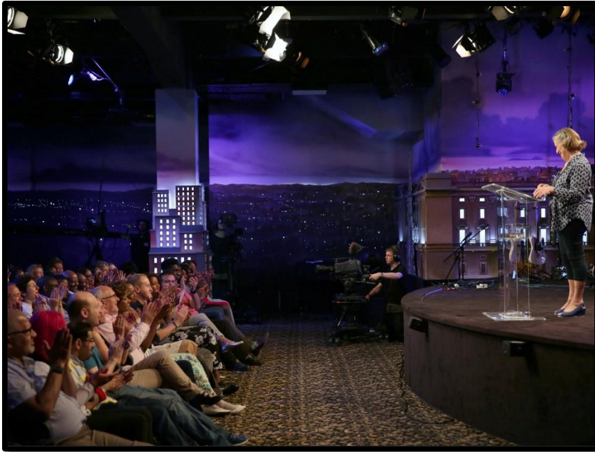
The Praise audience responding to the Mumfords' experiences of miraculous answered prayers.