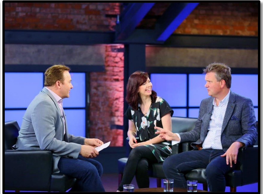
Christian songwriters, Keith and Kristyn Getty, on TBN Meets recounting how they wrote “In Christ Alone” – the most-sung hymn in UK churches for the last 9 years.