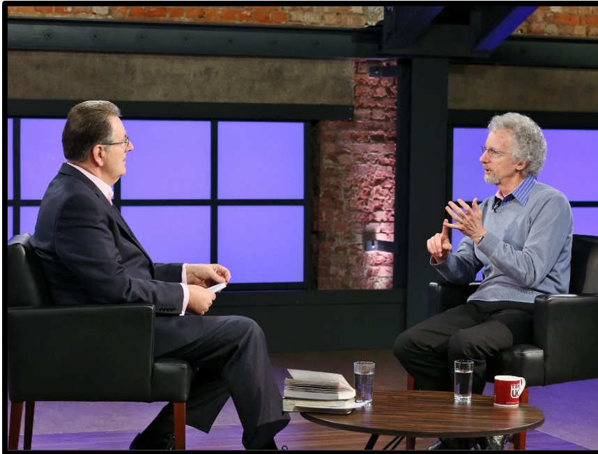
Philip Yancey, Christian author with over 14 million sales worldwide, explained to TBN Meets the idea for his latest book.