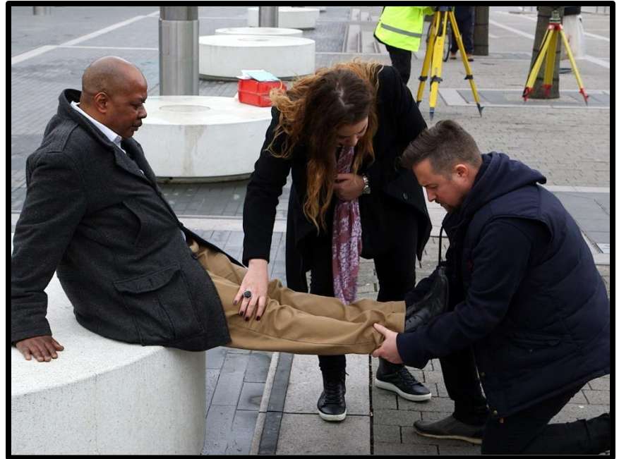
The encounters and healings they experienced will be included in Pastor Robby's Power Evangelism programme.