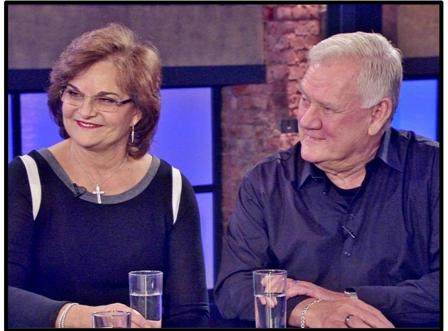
JAM is an international Christian humanitarian relief and development organisation.