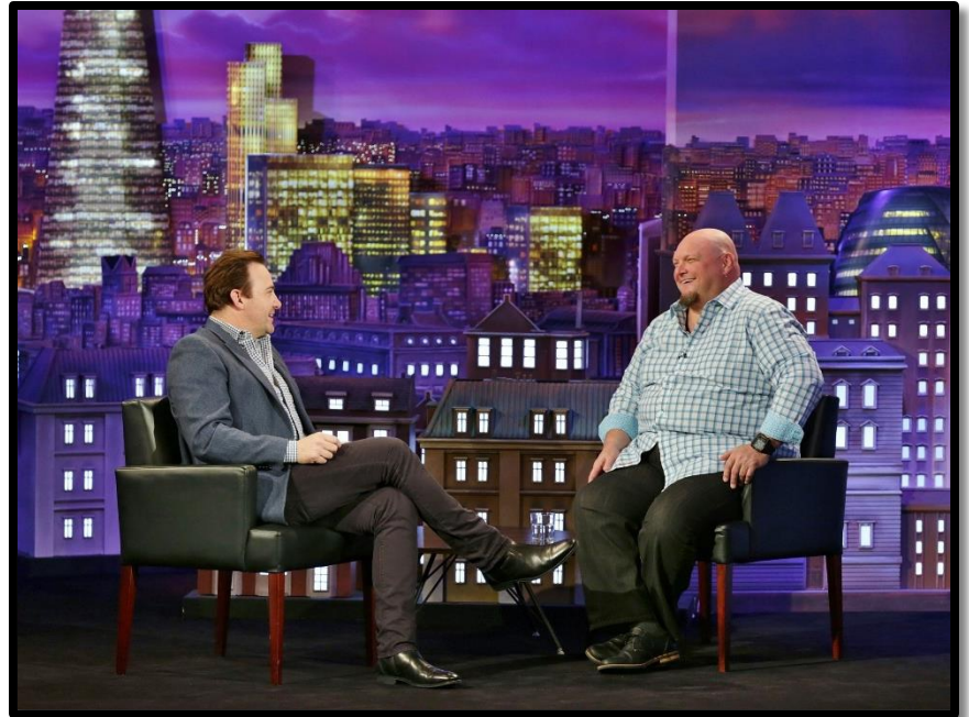
Robby Dawkins also appeared on TBN Meets , discussing his up-coming show, Power Evangelism .