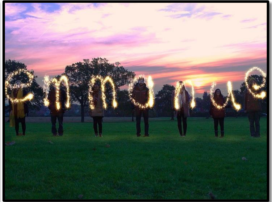
Another scene included some of the TBN UK team letter writing with sparklers.