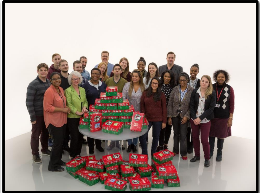
The TBN UK team spent a morning packing shoe boxes full of gifts for Operation Christmas Child.