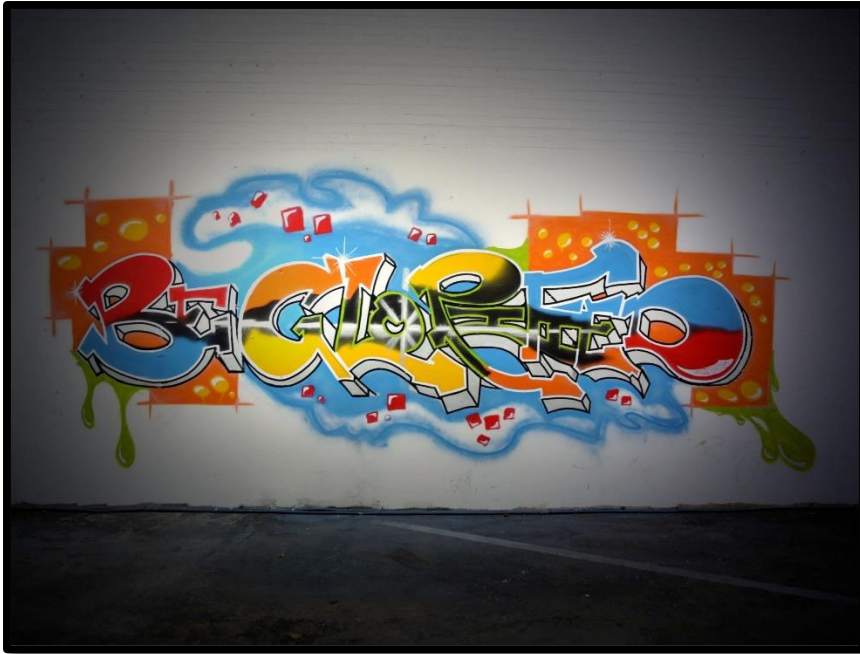
Our Christmas video also featured this “Be Glorified” graffiti art in our warehouse.