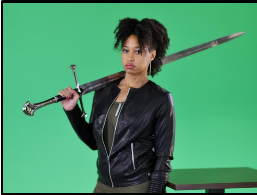
Actress, Tori Chase, took part in a photo shoot in our green screen studio to promote the film Daily Bread.