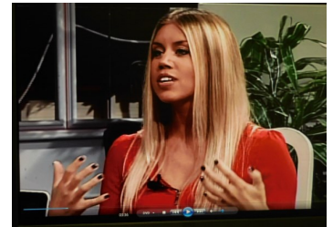
image of what you're supposed to look like. This is not real. You'll never become like that image because you're always lacking something. You have to ask yourself – What does God think about you? As

a daughter of God, you are to walk in your calling, walk in your identity, and honor God in everything you do. He made every woman to be beautiful in their own way. What defines you is what God placed within you – your goals, your ambitions, your heart cry, the things He has destined you for. "