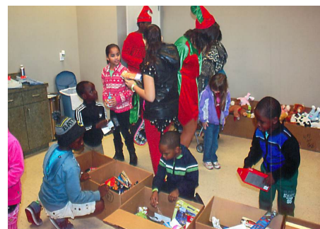
Toys were donated for girls and boys of all ages.