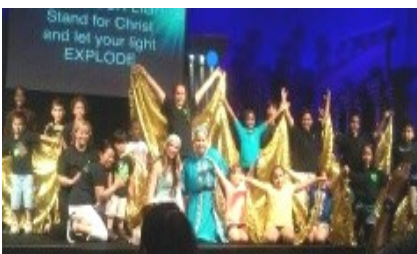
Ignite Your Light! Kids participate by singing, dancing, and wearing angel costumes.