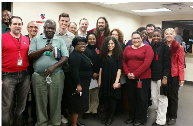
Christmas Crusades at Orange County Jail: The first night there were 31 Salvations, 52 rededications, healings, and many inmates' hearts encouraged about Jesus Christ!

HLE gave support to raise awareness about ALS/ Lou Gehrig's Disease. The Gala provided funds and hope to Florida families affected by the disease.