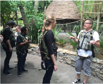
Everyone had to harness up for the big trek.