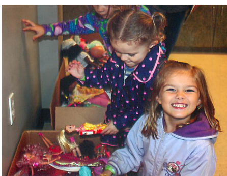
Kids love being able to choose the toy they like!

New Beginnings Healing Center annual toy Family Blessing in Orlando, FL.