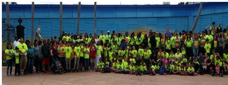
Osceola & Poinciana Preparatory School (411: people) They first came 5 years ago with 20 people.