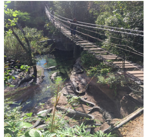
There is no fear with HLE team members.