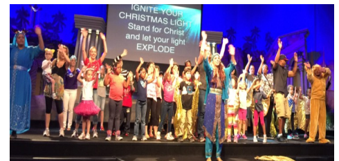
Children enjoy a short clip from "The Drummer Boy."