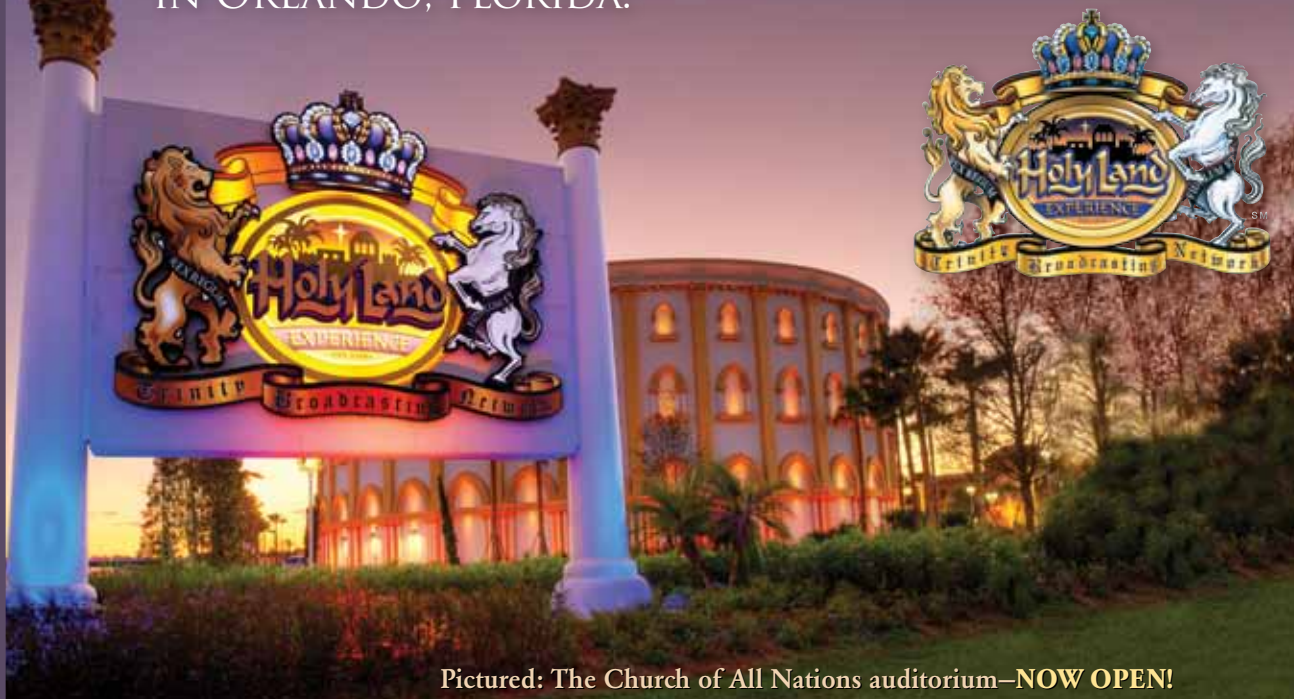
Pictured: The Church of All Nations auditorium—NOW OPEN!

EXPERIENCE LOVE...EXPERIENCE PEACE... EXPERIENCE JESUS AT THE HOLY LAND EXPERIENCE IN ORLANDO, FLORIDA.